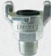
2-LUG MALE DEAD END