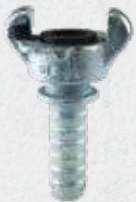
2-LUG HOSE END