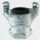
2-LUG FEMALE END