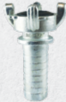
4-LUG HOSE END