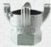
4-LUG FEMALE END